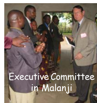
Executive Committee in Malanji