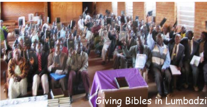
Giving Bibles in Lumbadzi