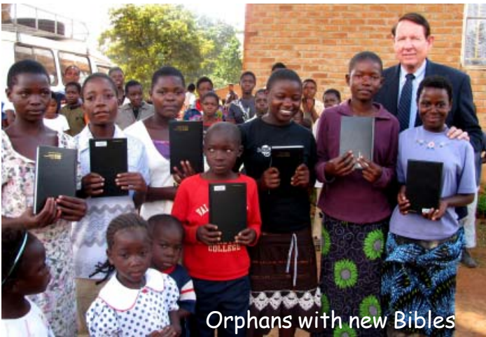
Orphans with new Bibles

*The reading glasses distribution was a great blessing. We gave 20 pair in each place plus a few to our coordinators (about 200 in all). They were so grateful but still some pastors whose number was not chosen before the glasses were gone said pleadingly, "Please give me glasses because I cannot read without them!" The pastors and wives loved the ties, scarves, and Ty beanie babies we gave at the end of each day.