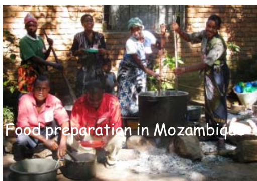
Food preparation in Mozambique