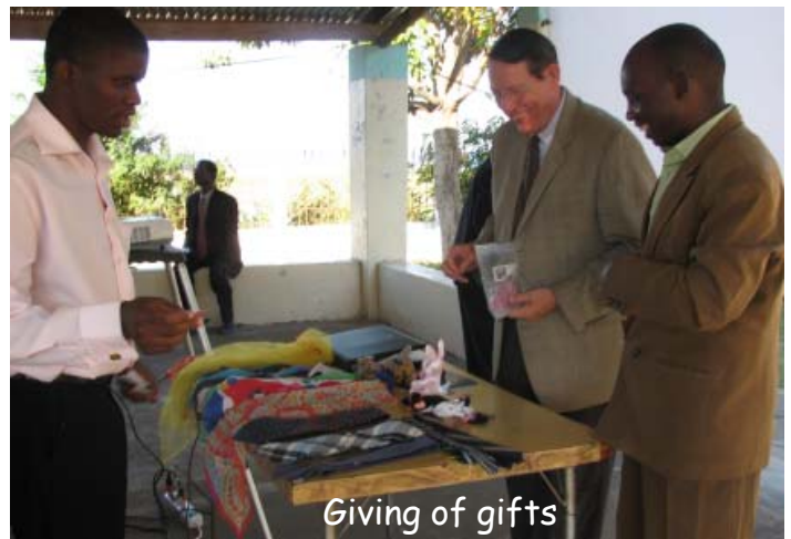
Giving of gifts