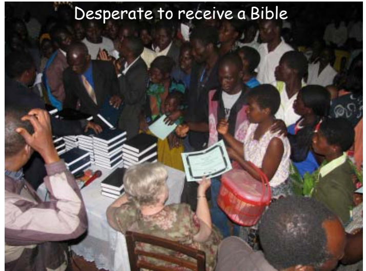
Desperate to receive a Bible

*Bible purchasing and distribution went well. We gave out 775 Bibles. Only in the two new places were the people so afraid we would not have enough Bibles for them that they began to push and demand. It is because of the great poverty they live with daily. Many believers who had no Bible now have their own. We gave about 10 to some older orphans who were faithful believers yet had no way to get a Bible. Praise be to God and thank those of you who gave for Bibles.