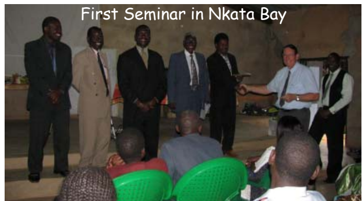
First Seminar in Nkata Bay