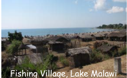
Fishing Village, Lake Malawi