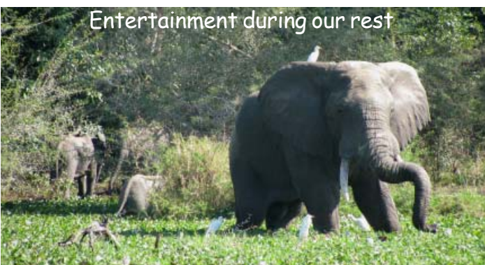
Entertainment during our rest